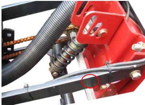
OEM parallel arms lacking a pre-drilled holes for mounting air spring brackets.

This kit contains two 726686 - 14" CNH Upper Parallel Arms that will be used to replace the existing OEM upper parallel arms. The OEM parallel arms lack the correct hole to enable the installation of the 726673 - CNH AirSpring Base Mount bracket. Remove and replace your existing parallel arms with those provided. Re-use existing hardware.