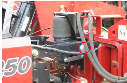
14" CNH Upper Parallel Arm replacements compatible with mounting of air spring brackets.

Parallel arm shown with 726673 - CNH AirSpring Base Mount bracket installed.